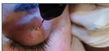
Air ionisation with discharges Needle close to the skin for a dermo-ablative plasma effect.