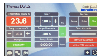
Endo D.A.S. interface