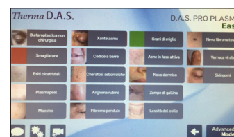
D.A.S. Pro Plasma interface

D.A.S. Pro Plasma. The dermo-ablative function of Therma D.A.S. is based on the energy amplification that allows to cut and coagulate the skin. The induction principle used during the treatment is obtained by a succession of electric discharges generated by a high voltage current. With a distance of 0.5mm between the tip of the device and the skin, the air loaded with free electrons absorbs a large amount of energy, ceases to be an insulator and begins to conduct the electric current, generating the discharges. The air is ionized and it becomes Plasma. Landfills provide heat that increases the temperature of the skin and can treat many indications without risk of injury to the patient. A device that modulates frequency and power in fractional mode to : Perform skin resurfacing, Reduce localized skin laxity, Treat benign dermal and epidermal skin lesions, Improve skin texture. Endo D.A.S. Innovative, the endo-regulated radiofrequency function of Therma D.A.S. is based on the gradual and controlled heating of the subcutaneous tissues with a proprietary cannula for the intralifting treatment. Treatment sessions last 20 minutes and are painless, patient feels a light heating of the treated area. Positive and unbelievable dermal effects of endo-regulated radiofrequency : Improvement of skin texture, Collagen stimulation, Lifting effect and Rejuvenation of the skin.